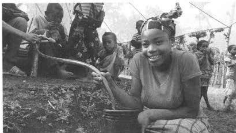
Above: Architecture and Vision, Marks Water, Inauguration day: canopy installation, Dorze, Ethiopia, 2015.